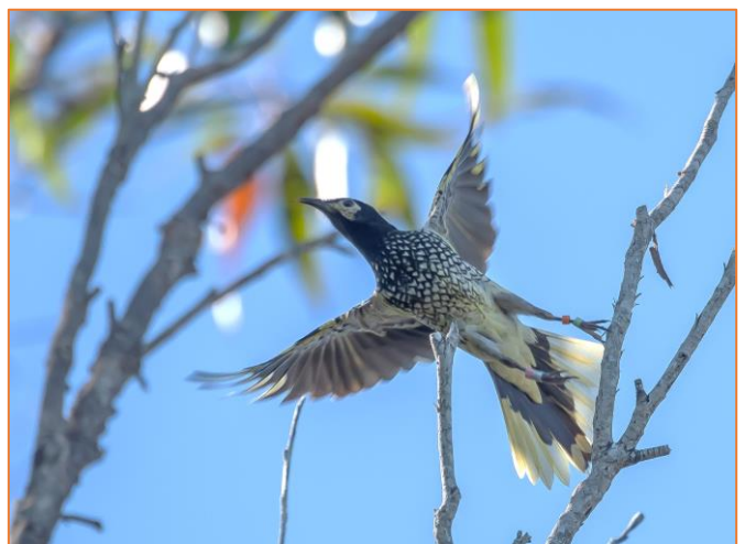
OPKM' making sure there's no doubt about the colours of the bands on his outstretched legs as he takes flight at Red Rock