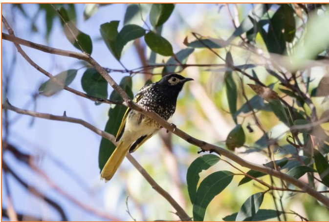
One of up to 11 (wild) Regent Honeyeaters found in south-west Lake Macquarie this winter

All involved in the 2022 Regent Honeyeater captive release acknowledge the sovereign owners and knowledge-holders of the Country we have had the privilege of walking on for this program – the Wonnarua people . We also recognise that sovereignty was never ceded; it always was and always will be, Aboriginal Land.