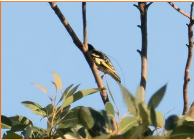
One of our 2022 released zoo-bred Regents showing the antenna from a radio transmitter in south-west Lake Macquarie (Rob Palazzi)

As if it wasn't exciting enough to have had such a great number of Regents in the area, another HBOC member captured a photo of one showing an antenna from a radio transmitter. This was an exciting find for the tracking team, and although the band combination could not be determined from the photograph it was pleasing to see one of our zoo-bred birds once again associating with wild birds. This was also the first evidence we'd seen of a released bird in the same area as wild birds away from the vicinity of the release site too – exactly the sort of results we're after in this important work!