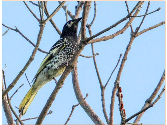
One of the wild Regent Honeyeaters found in Red Rock (Peter Smith)

Continuing with the run of coastal sightings, two birds were found in late June on the edge of the northern NSW coastal village of Red Rock by Peter and Judy Smith. As with the Lake Mac flocks, these two birds were feeding on Swamp Mahogany blossom with many other species of nectarivores. After close examination of photographs one of the Regents was noticed to have brown wing coverts and tail feathers; indicative of a first-year bird and evidence of at least one more successful nest somewhere in the 2022/23 breeding season (bringing the total successful breeding attempts to three). With last year's breeding season being one of the poorest on record in terms of nests observed, it was extremely heartening to find another piece of evidence of success had somewhere in their range.